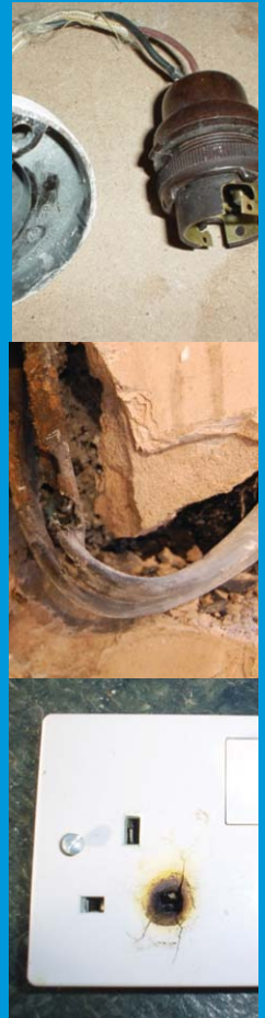
Typical examples of potentially dangerous electrical installations